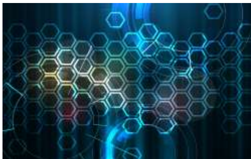
Figure 1: Insert caption to place caption below figure (Arial 10)